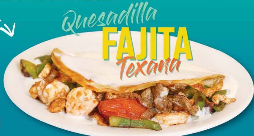
Quesadilla FAJITA Texana

MAKE IT SPECIAL ADD LETTUCE, SOUR CREAM, GUACAMOLE AND TOMATOES. $2.99