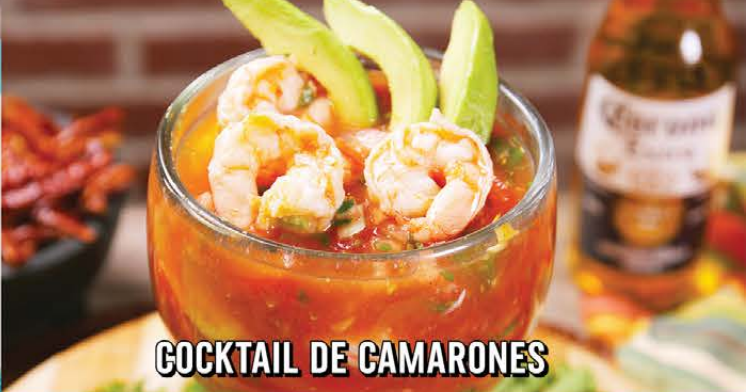
COCKTAIL DE CAMARONES