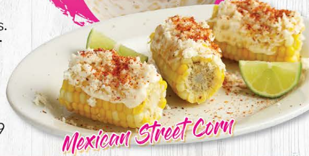
Mexican Street Corn